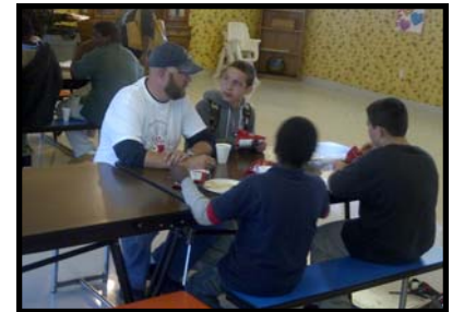
Pictured above: Savvis Volunteer spends time with Emerson students during lunch.

"Hola Buenos Tardes" is what you might have heard if you attended "Culture Fest". Culture Fest was a display of information and exhibits from all around the world. Each class had a continent they were responsible for re-