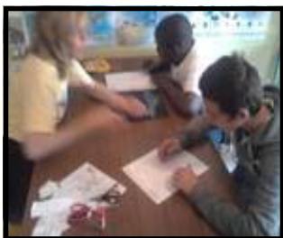
Pictured above: A volunteer from Webster University's - Webster Works WorldWide Service Day comes helps out in the classroom.